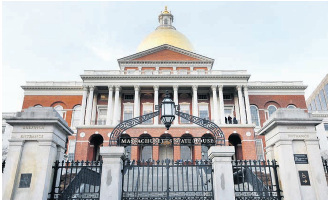
The Massachusetts Statehouse is seen, Jan. 2, 2019, in Boston.